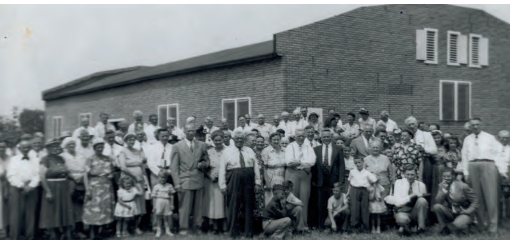
A group of people standing in front of the tabernacle of the German Branch campgrounds in Bridgman, Michigan in 1951.